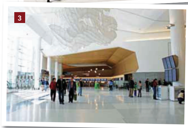
1. Ticketing areas are a mix of natural light, warm finishes and playful lighting. 2. T2's arrivals area features artist Natori Sato's "Air Over Under" installation. 3. The lobby leading to the security area is a breathing space.